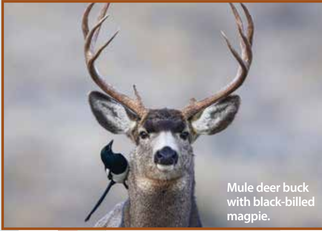
Mule deer buck with black-billed magpie.