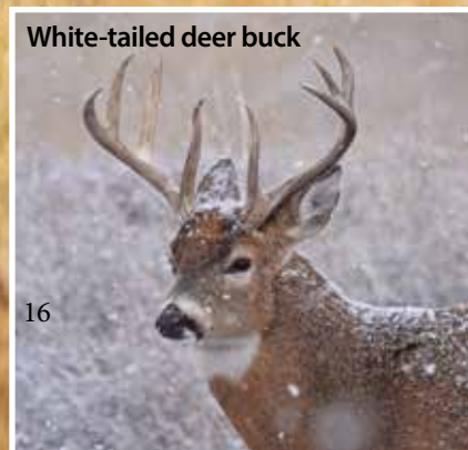
White-tailed deer buck

Preference-point requirements can be found at the Colorado Parks and Wildlife website. There are separate tables for each species. Preference-point requirements have the ability to change dramatically from year to year based upon the number of applications and the number of licenses issued for each unit, but usually don't vary much from year to year. Visit the website at: cpw.state.co.us/bg-stats